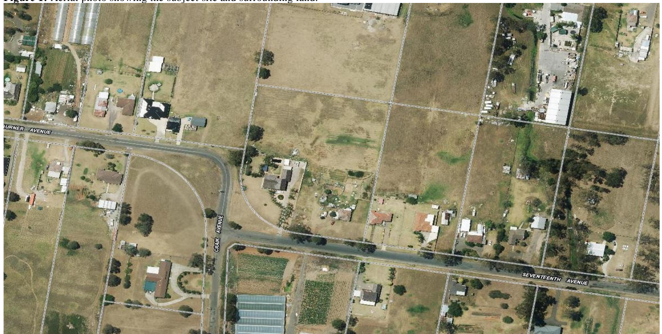
Figure 1: Aerial photo showing the subject site and surrounding land.