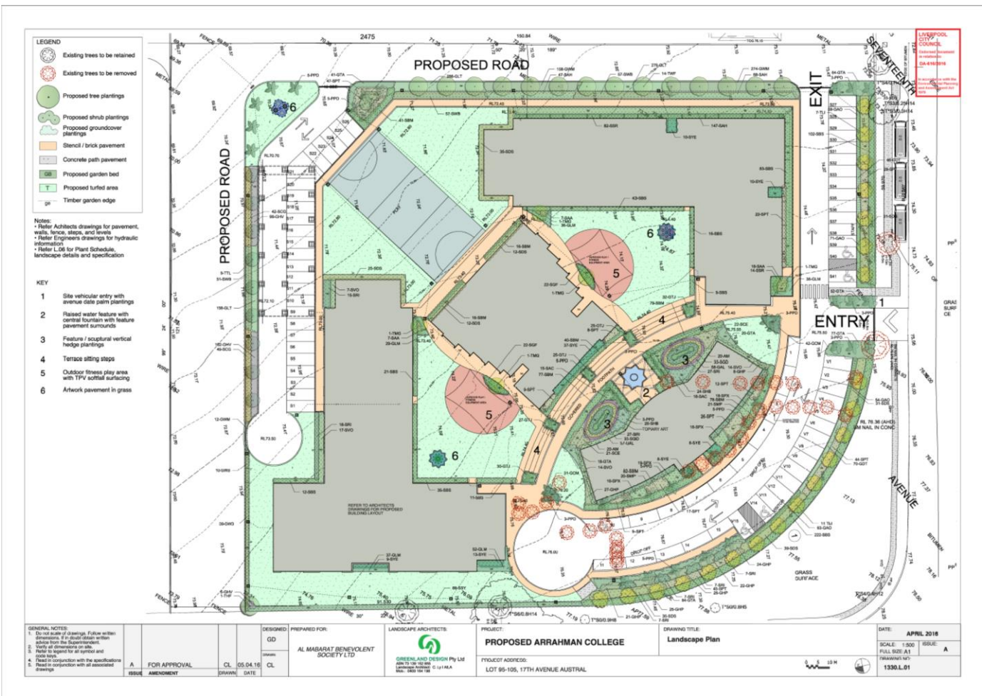
Figure 2 – Site Plan prepared by Greenland Design